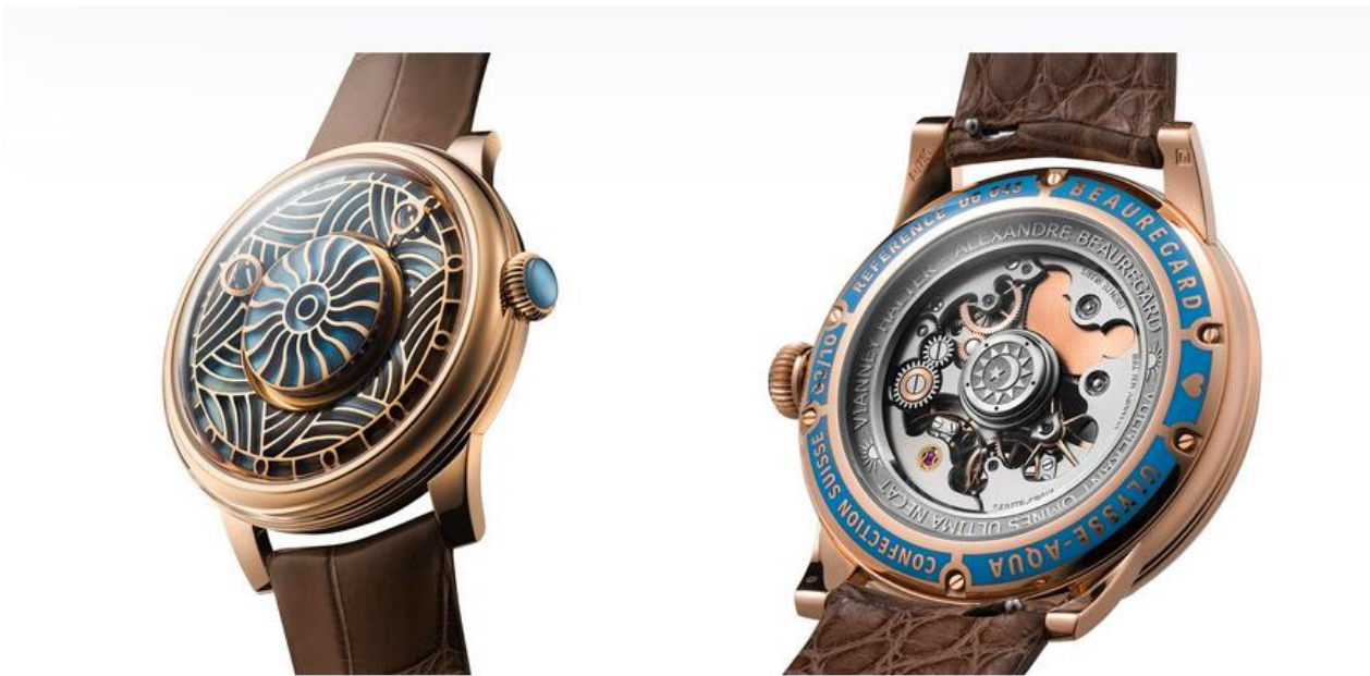
The Beauregard x Vianney Halter Ulysse

Meanwhile, the 41mm 18K rose gold case contains a movement that allows for 56 hours of power reserve and a water resistance of 30 meters. But if you wear this magnificent watch in the pool, I may have to hunt you down personally and hurt you with my bare hands.